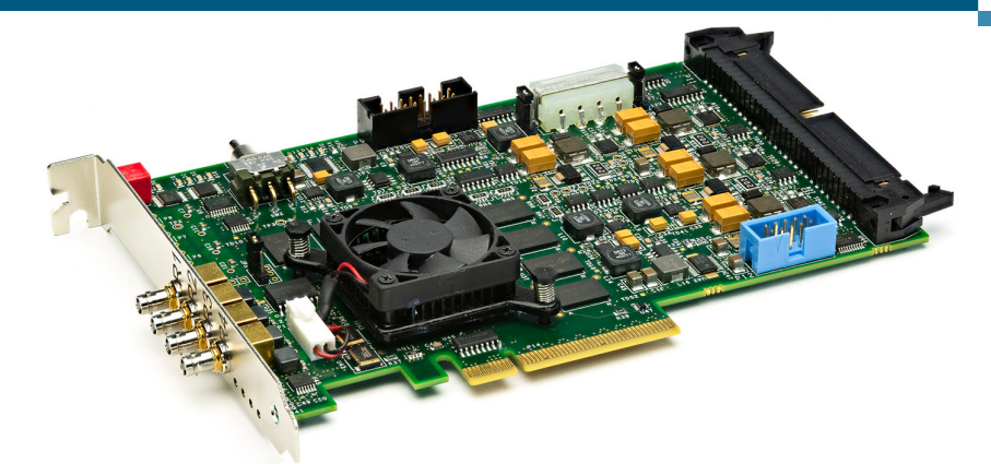
BitFlow > Frame Grabbers > Claxon-CXP4

CoaXPress Version 2.0 doubles the speed of CXP up to 12.5 Gb/S. BitFlow stays ahead of the curve with its Claxon frame grabber that support up to four links of CXP-12.