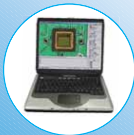
Connect to PC

Operation System : WINDOWS XP Recommended PC : Above ICH5 CPU : Pentium4 Above 1.7GHz (Need embedded USB2.0 port) Memory : Above 512MB Included : Device Driver, Viewer Software, 5V AC Adapter, 1.8m USB cable Optional : C Mount Lens, HDMI Monitor, 1.5m / 3m / 5m HDMI Cable, SDK, HDMI-DVI converting connector, DVI cable