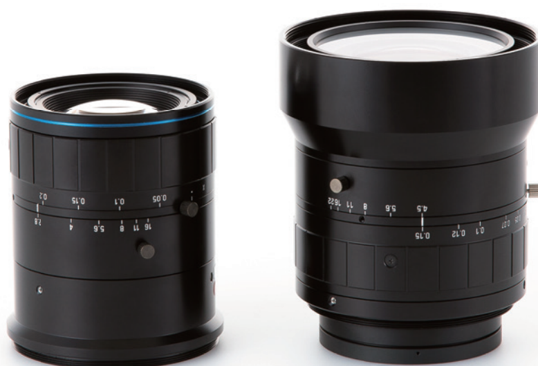
Image circle \phi 75\text{mm} , line scan macro lens with short focal length

Ensures illumination uniformity from the center to the edge of the lens